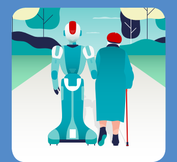
2. Social Robots