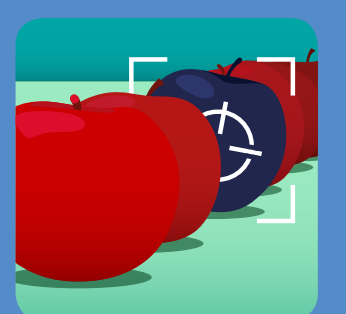
7. Advanced Food Tracking and Packaging