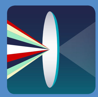
3. Tiny Lenses for Miniature Devices