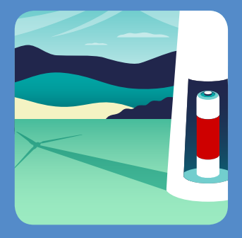
10. Utility-Scale Storage of Renewable Energy