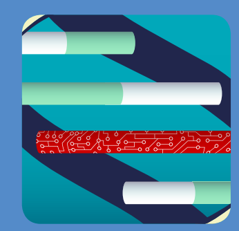
9. DNA Data Storage