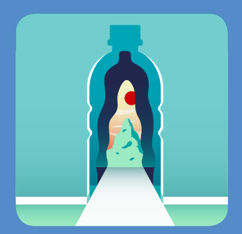
1. Bioplastics for a Circular Economy