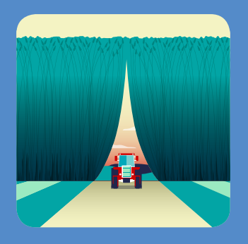
5. Smarter Fertilizers Can Reduce Environmental Contamination