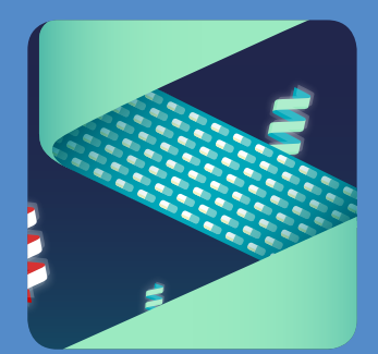
4. Disordered Proteins as Drug Targets